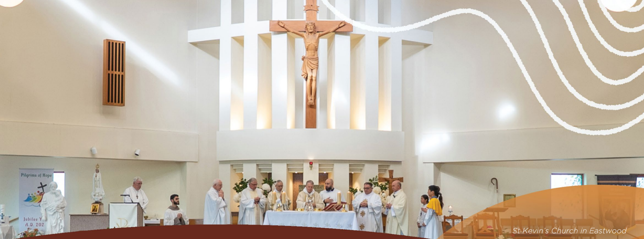
St Kevin's Church in Eastwood