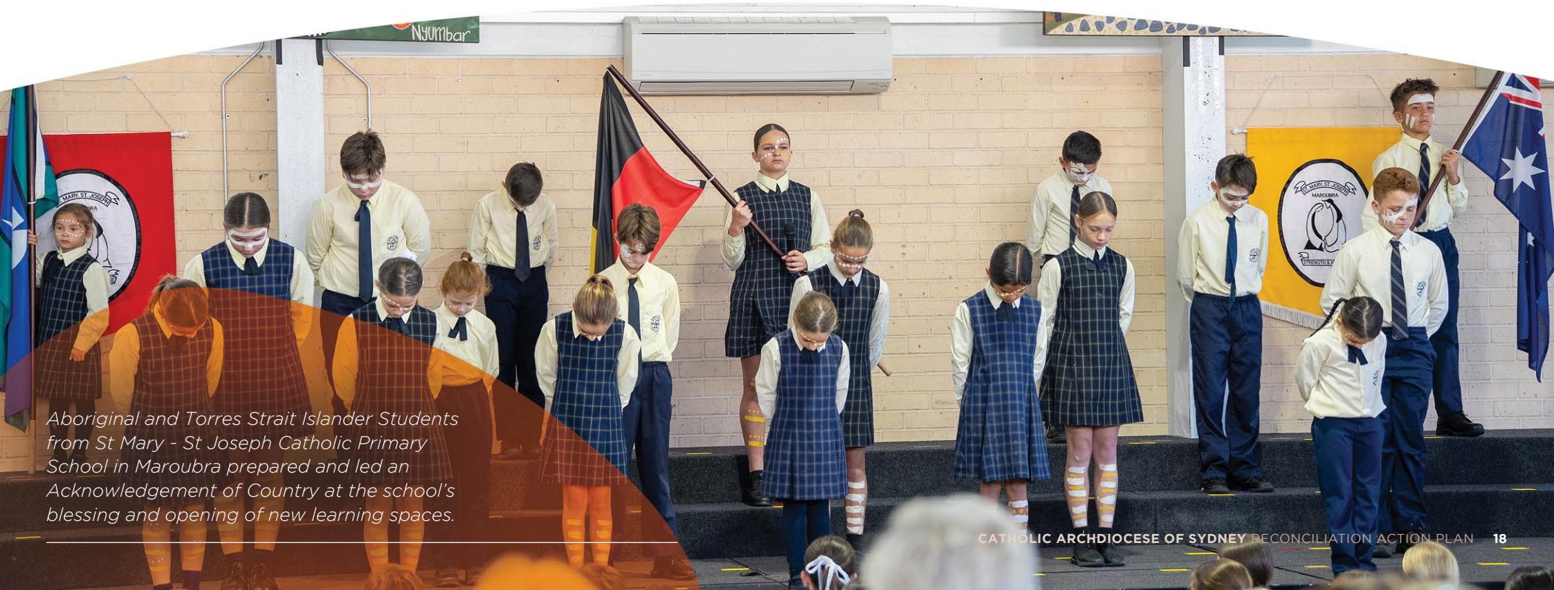
Aboriginal and Torres Strait Islander Students from St Mary - St Joseph Catholic Primary School in Maroubra prepared and led an Acknowledgement of Country at the school's blessing and opening of new learning spaces.