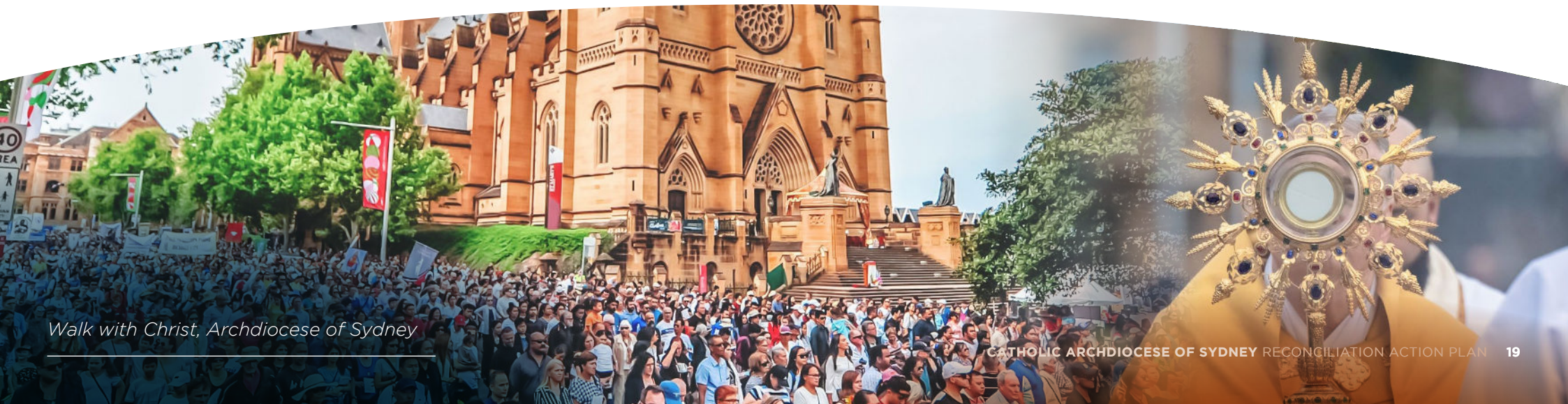
Walk with Christ, Archdiocese of Sydney