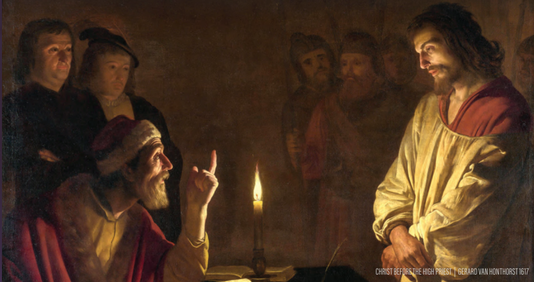
CHRIST BEFORE THE HIGH PRIEST | GERARD VAN HONTHORST 1617

Our Father | Hail Mary | V. Christ was obedient unto death. R. Unto death on a Cross.