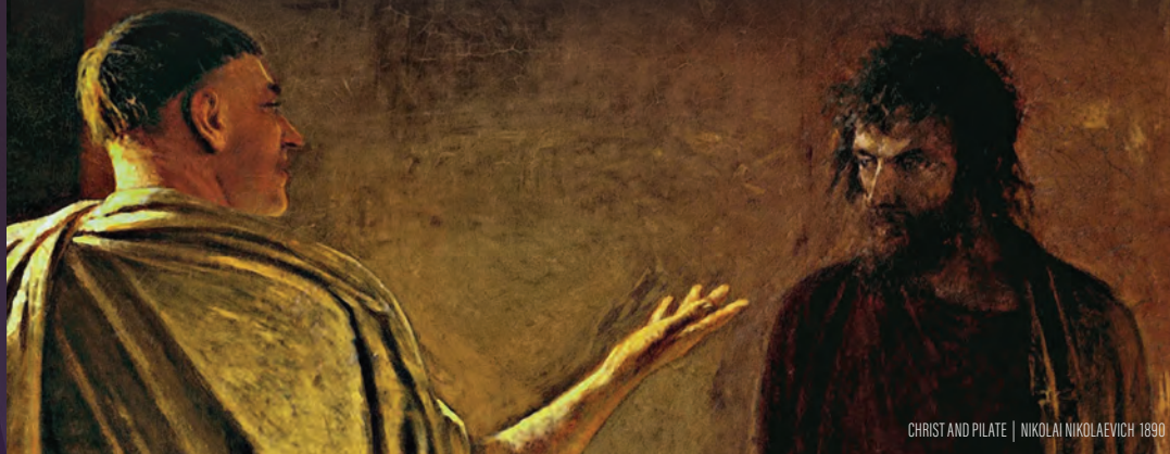
CHRIST AND PILATE | NIKOLAI NIKOLAEVICH 1890

Our Father | Hail Mary | V. Christ was obedient unto death. R. Unto death on a Cross.