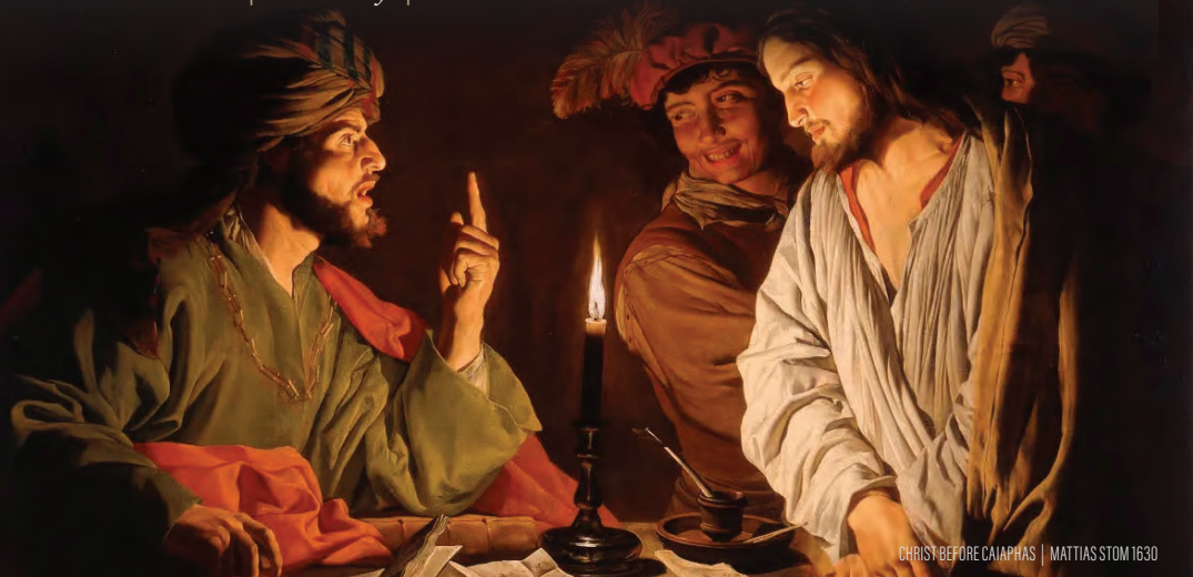
CHRIST BEFORE CAIAPHAS | MATTIAS STOM 1630

Our Father | Hail Mary | V. Christ was obedient unto death. R. Unto death on a Cross.