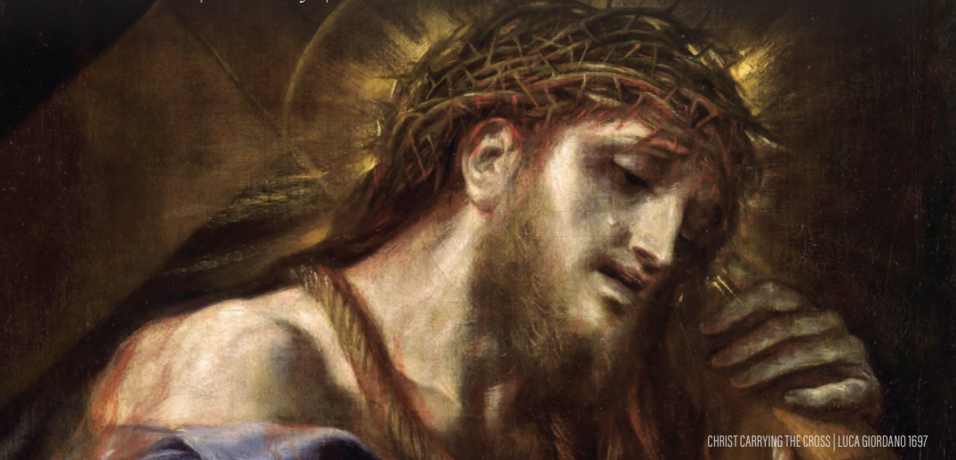
CHRIST CARRYING THE CROSS | LUCA GIORDANO 1697

Our Father | Hail Mary | V Christ was obedient unto death. R. Unto death on a Cross.