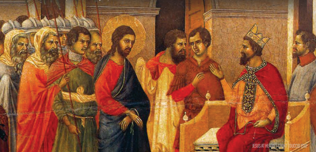
JESUS AT HEROD'S COURT | DUCCIO 1310

Our Father | Hail Mary | V Christ was obedient unto death. R. Unto death on a Cross.