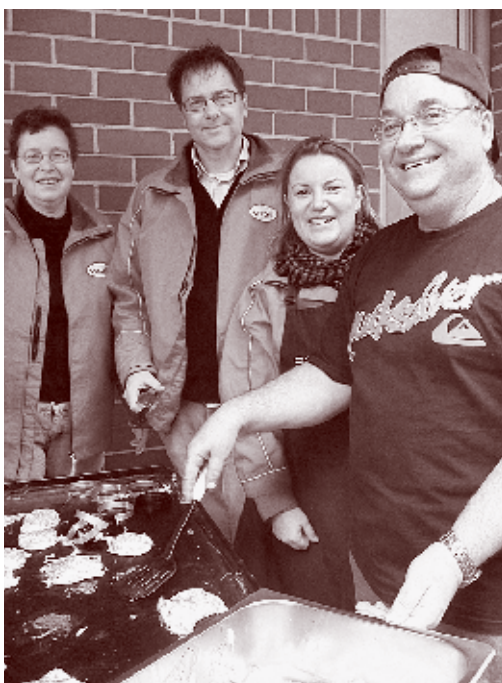
■ GIO and OzHarvest volunteers cook up a Big Barbecue Breakfast for Redfern's homeless and families in need