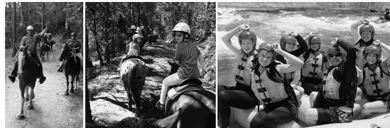
■ At Deaf Dudes teens enjoy horseback riding, white water rafting and other great activities.

Deaf Dudes also encourages the deaf teens to come together and have fun without having to rely on interpreters or family to make themselves understood. This in turn gives them a real sense of